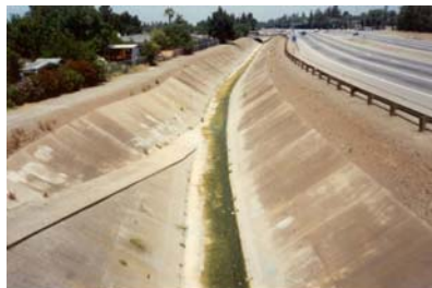
Example of an engineered channel

In the past, creek bank erosion was addressed by constructing engineered channels. But this created new problems for salmon and other migratory fish, and in some locations resulted in excessive sedimentation in the channels, requiring costly maintenance.