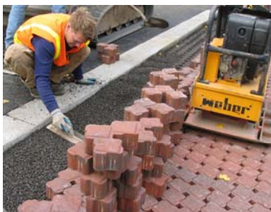
Ungrouted modular pavers are an example of a hydrologic source control.

Flow duration controls are designed so that the post-project stormwater discharge rates and durations match the pre-project rates and durations from 10 percent of the pre-project 2-year peak flow up to the pre-project 10-year flow. Projects that require flow duration controls typically also require water quality treatment controls (see flyer on stormwater quality requirements, referenced under “For More Information”). If feasible, combining flow duration and water quality treatment into one facility will reduce the land area needed for stormwater management.