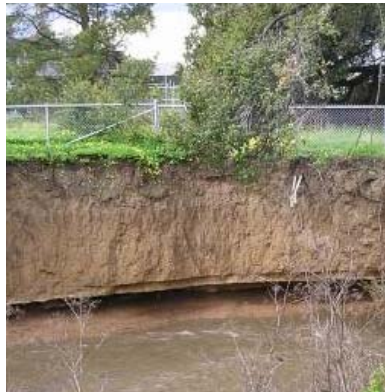
Example of creek bank erosion

When undeveloped land is covered with buildings and pavement, it causes more stormwater runoff to flow into creeks at faster rates. This may result in creek channel erosion, as well as flooding, habitat loss, and, in some cases, property damage. These development-induced changes to the natural hydrological processes and runoff characteristics are called hydromodification.